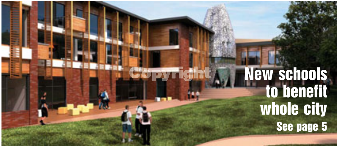
New schools to benefit whole city See page 5