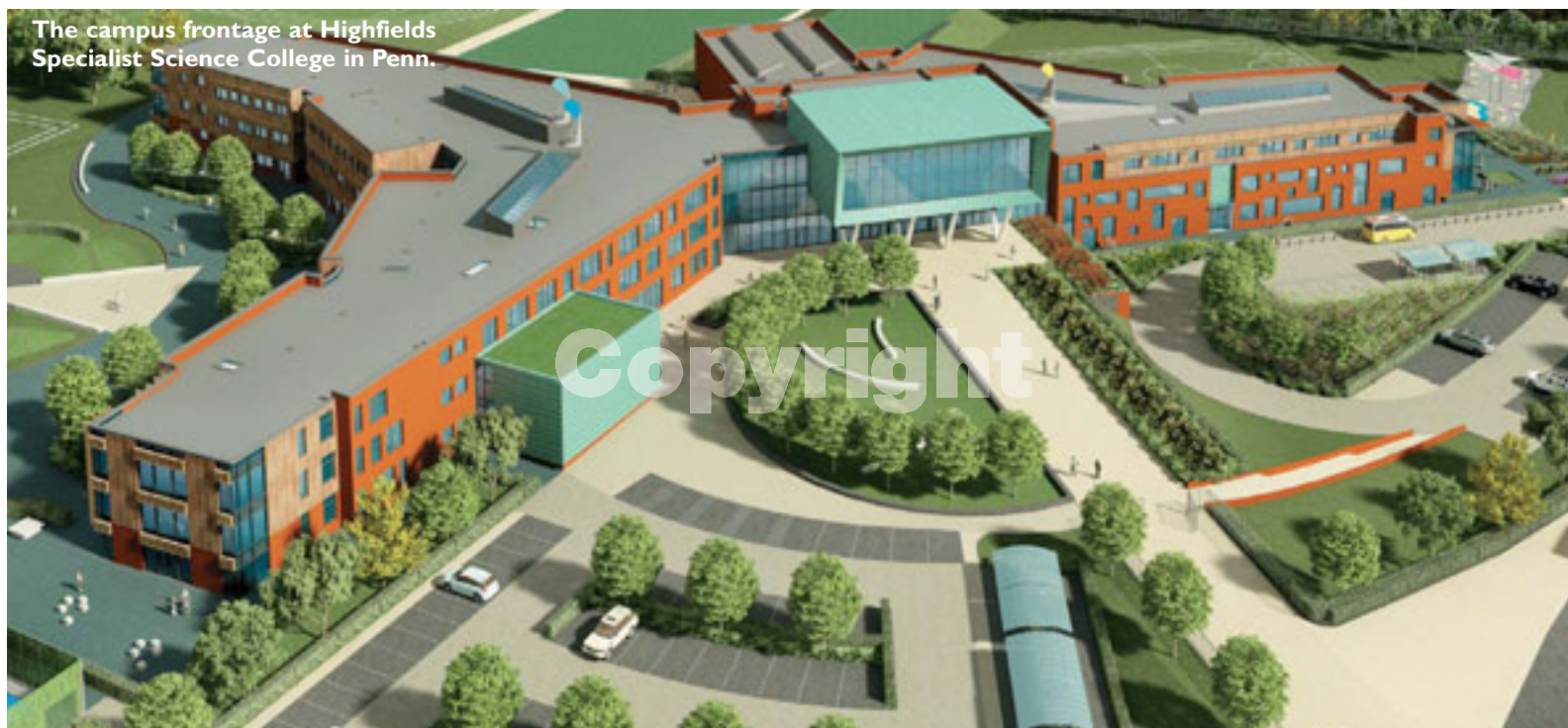
The campus frontage at Highfields Specialist Science College in Penn.

RESIDENTS can get advice about reducing their carbon footprint by logging on to www.wolverhampton.gov.uk/gogreen and view a series of pages on the city council's website that offer tips on being energy efficient in the home and helping the environment.