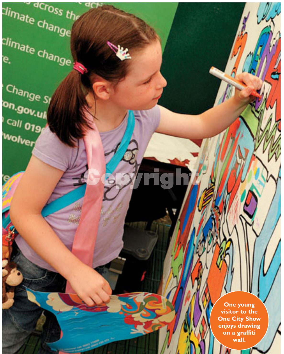
One young visitor to the One City Show enjoys drawing on a graffiti wall.

community involvement officer, said: "We are pleased to see that people feel we are heading in the right direction when it comes to many important areas including home recycling, educational